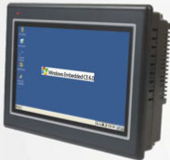
PC5070TN 7" TFT Color LCD