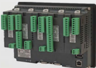
7" TFT Color LCD with Pluggable I/O Modules