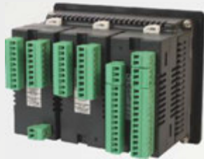
4.3" TFT Color LCD with Pluggable I/O Modules